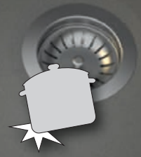
Impact & scratch resistant